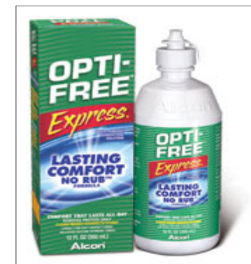
Our doctors recommend Opti-Free products by Alcon.

could not protect patients who had been exposed to acanthamoeba from other sources.